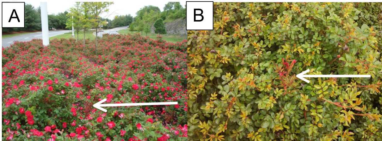
Fig.1. A) Rose plant symptomatic with rose rosette (arrow) nestled within a bed of asymptomatic and presumably healthy plants. B) An infected, symptomatic cane may not be apparent initially.

In spring and fall, many healthy roses have reddened foliage. When roses are infected with RRV, the foliage may be red throughout the summer (Fig. 2. A). Diseased roses may also have strapped (unusually long, thin) leaves. However, in some plants, little red pigmentation is obvious (Fig. 2. B). Increased thorniness and flattening of stems (fasciation) is often observed (Fig. 2. C), but may be absent in symptomatic tissues (Fig. 2. B). Shoots may become a large mass of distorted shoots (witch's broom) (Fig. 2. D).