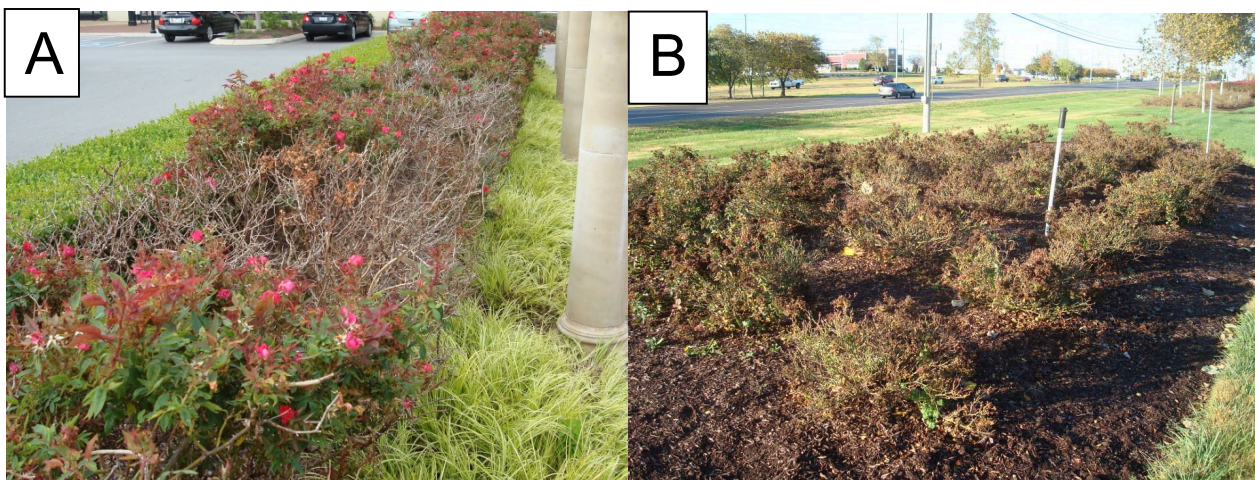
Fig.4. A) Death of these rose bushes began three years after first symptoms were apparent. B) If left unchecked, rose rosette will destroy entire beds of roses. Spread may appear slow at first due to long latent periods in newly infected plants. It is common for incidence of symptomatic roses to remain low in a large bed of newly planted roses for 1-2 years and in the next year, have nearly all plants become symptomatic rapidly.

Rose bushes will decline and begin to die from rose rosette (Fig. 4.). The disease is usually fatal in 3-4 years. Cane mortality is usually observed in spring when symptomatic canes fail to push out new foliage since canes with rose rosette symptoms appear to be more susceptible to winter-kill/desiccation. Low starch reserves in symptomatic canes may be responsible for decreased spring growth and ultimately death of plants. Infected roses may have diminished root systems which may be a result of decreased carbohydrate storage. Large commercial plantings or private rose gardens can be decimated by rose rosette if the disease is left unchecked.